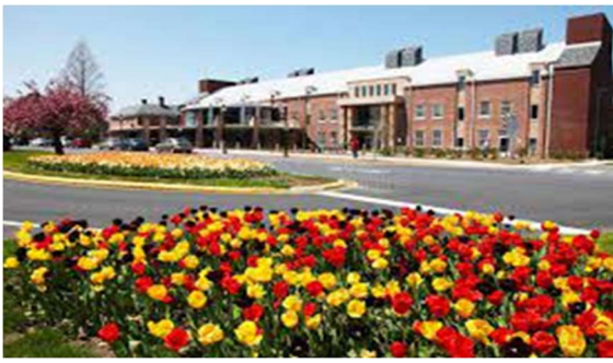
BEAUTIFUL TULIPS PLANTED BY THE CITY OF DOVER GROUNDS DEPT.